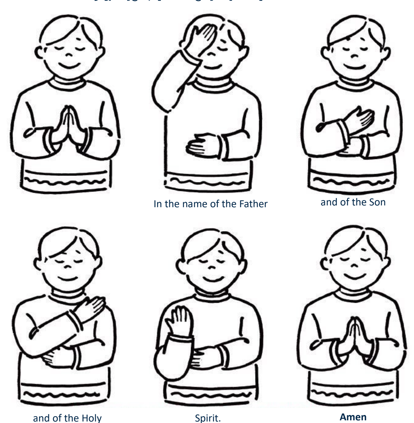
Why do we make this sign?